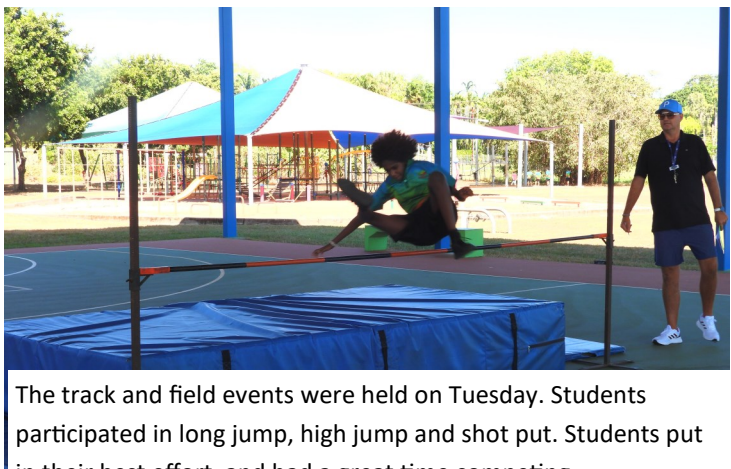
The track and field events were held on Tuesday. Students participated in long jump, high jump and shot put. Students put in their best effort and had a great time competing.