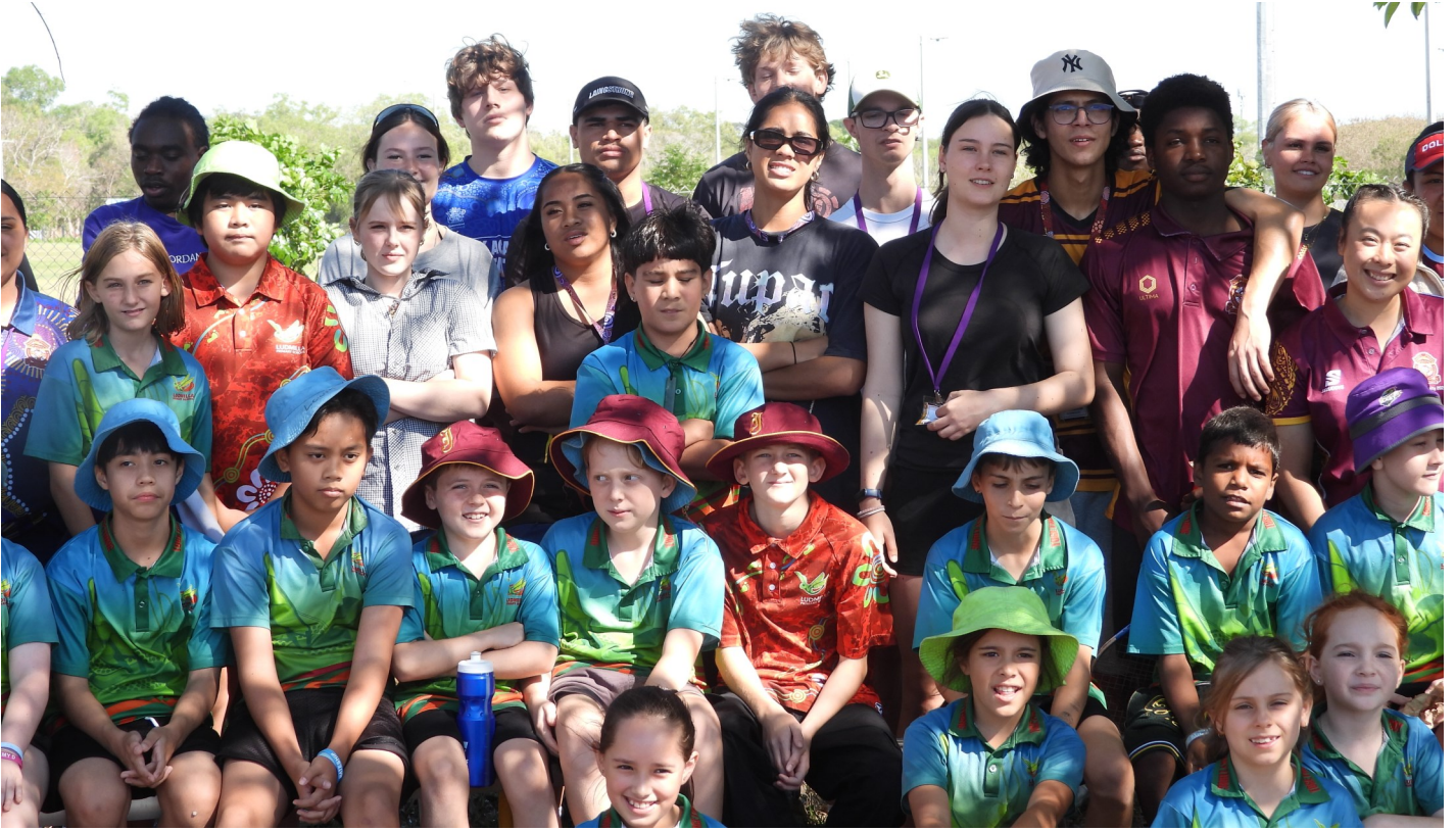
Students from St James College in Brisbane again visited Ludmilla Primary today for an exchange of cultures and a much appreciated game of Bat and Ball.